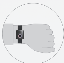
worn as watch